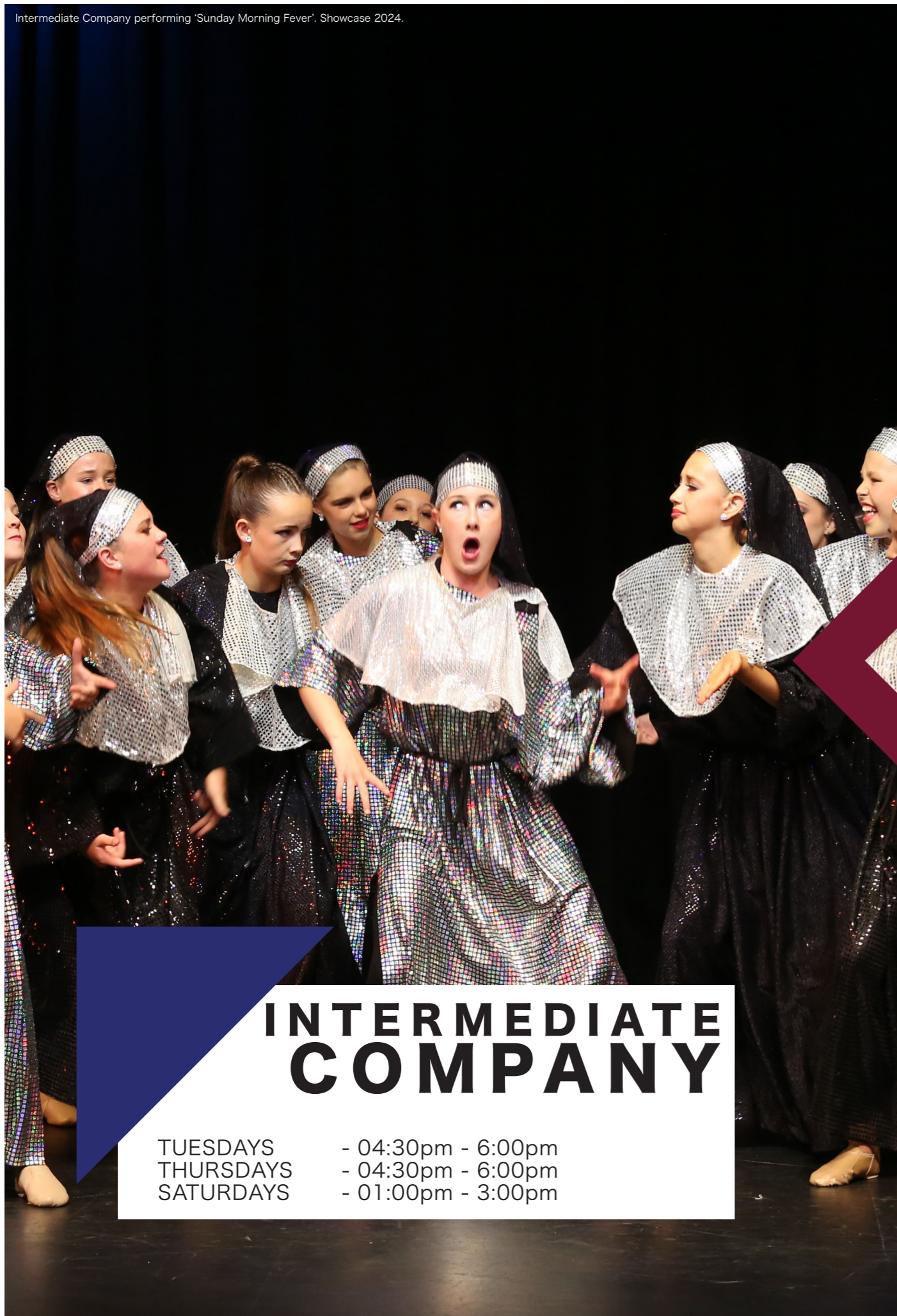
Intermediate Company performing 'Sunday Morning Fever'. Showcase 2024.