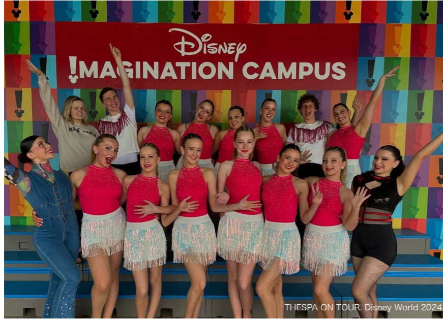
THESPA ON TOUR, Disney World 2024.