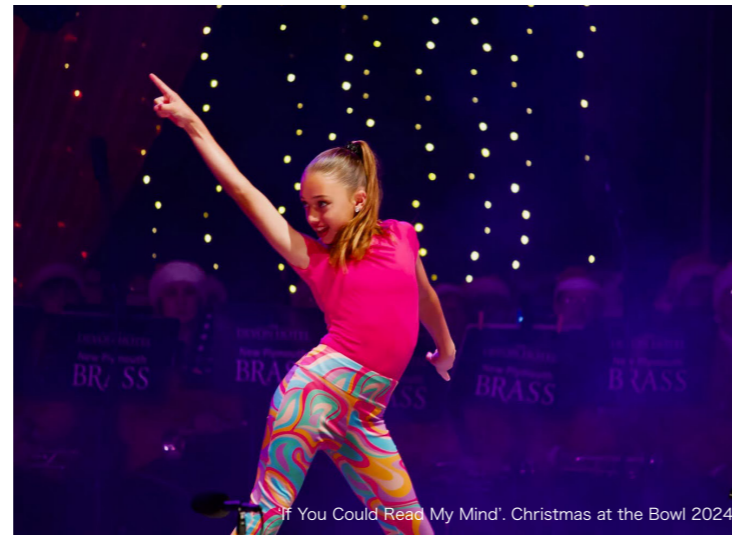
'If You Could Read My Mind'. Christmas at the Bowl 2024.

We will always produce an end of year showcase with our friends at 4th Wall Theatre, split into a Company show and a Musical Theatre show to allow everyone to purchase a ticket and make the show run shorter. Keep an eye on socials towards the end of the year, or join the mailing list at 4th Wall Theatre for more information when it arrives!