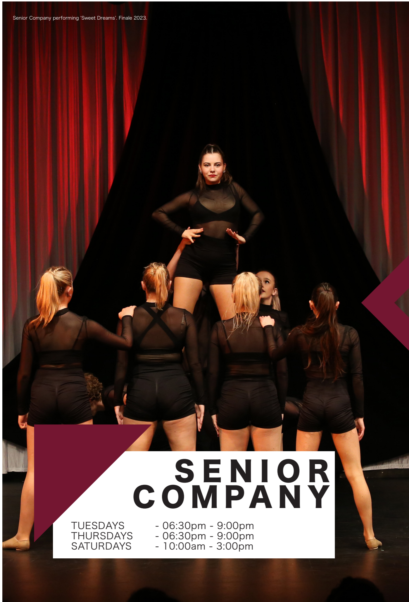
Senior Company performing 'Sweet Dreams'. Finale 2023.