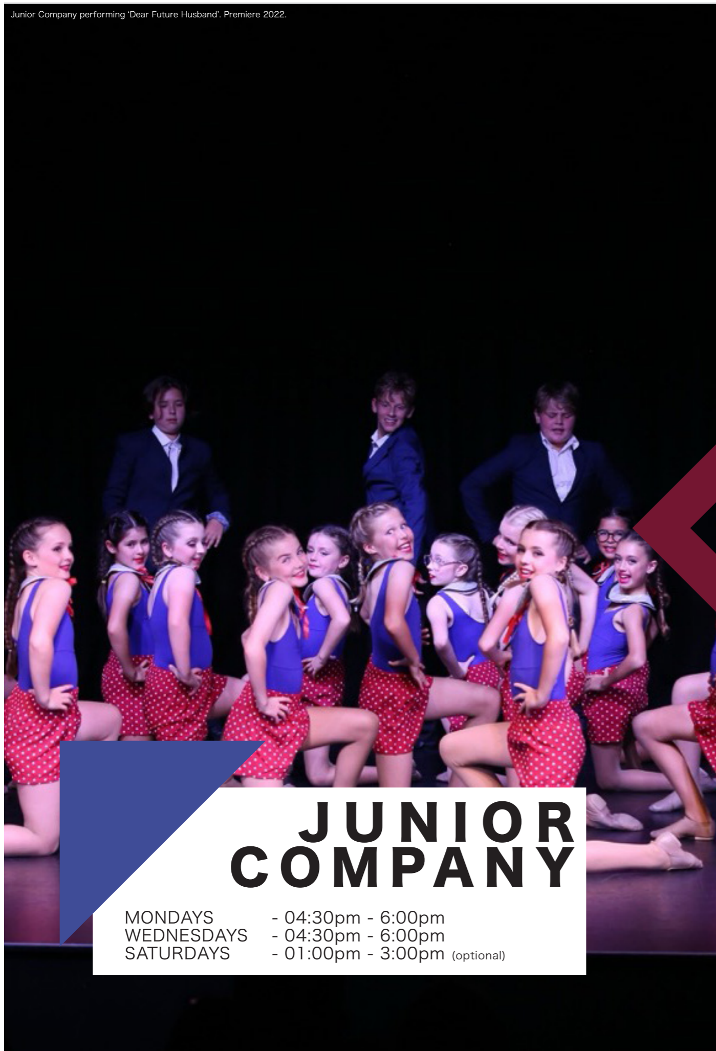
Junior Company performing 'Dear Future Husband'. Premiere 2022.