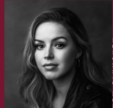
ANNALEE KEMSLEY @ANNALEEKEMSLEY