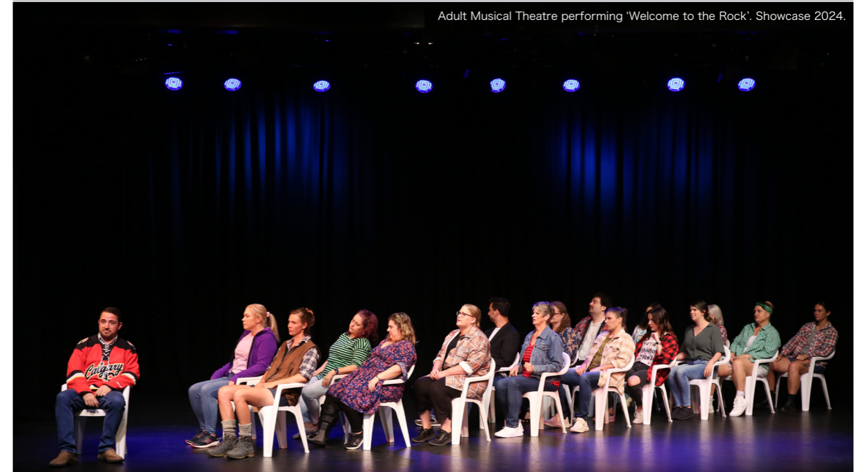
Adult Musical Theatre performing 'Welcome to the Rock'. Showcase 2024.

Please note age range is just a guide. If you are considering a different class than suggested, please contact us.