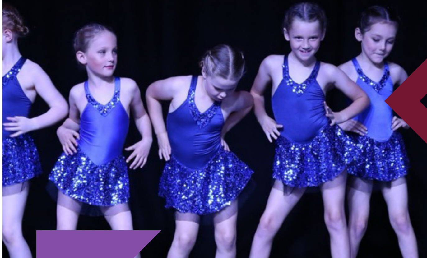
Mini Jazz performing 'Zero to Hero'. Premiere 2022.