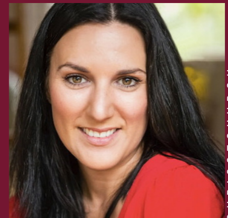
HOLLY CHAPPELL-EASON @TWO.PRODUCTIONS