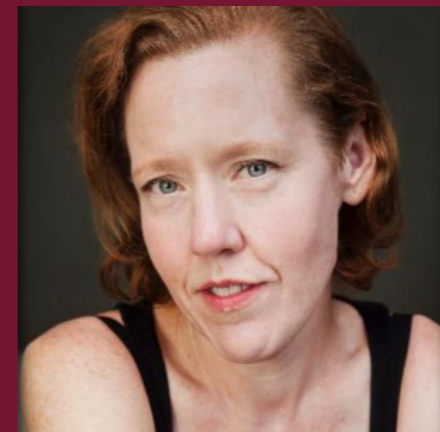
CIENDA MCNAMARA @CIENDAMC